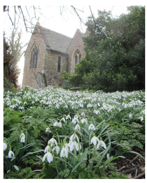
Snowdrops in Birstall Churchyard