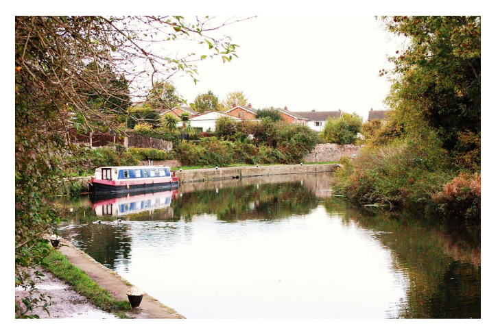
Narrow Boat, Birstall

We may also continue to use the signing-in sheet at both church entrances. Also display the QR (Test and Trace) notice.