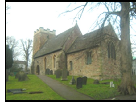
St James the Great Birstall