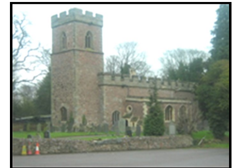
Our Lady & St Nicholas Wanlip