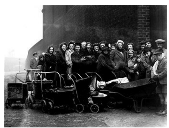
Women waiting to collect coal from a depot, 1947

Eventually we reached a gate, and I think my mother handed over some paperwork and then we went home. I don't think that I knew what all this was for, but what I do recall as if it was yesterday was the awful pervasive smell that came from somewhere near.